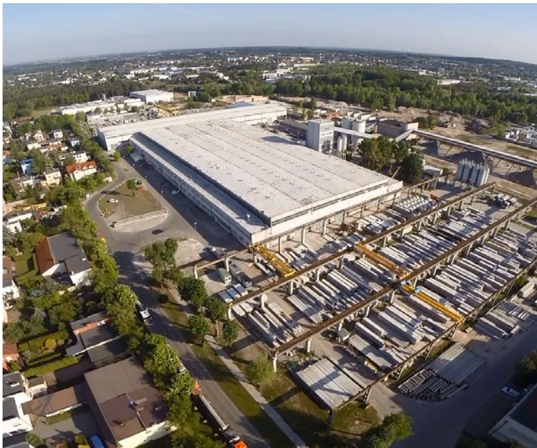
Fig 1. A view of Pekabex S.A. (Poland).

The company produces traditional reinforced elements, as well as modern prestressed elements used in enclosed structures (e.g. production and storage halls, offices, trade objects, railway stations, parking places), engineering objects (e.g. bridges, tunnels), and atypical designs. We offer wide range of standard products and realize special orders for individual designs. Pekabex S.A. possesses six production plants located in Poznań, Gdańsk, Bielsko-Biała, Mszczonów and Marktzeuln.