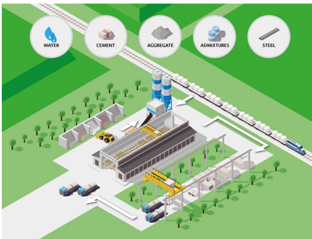
A scheme of manufacturing of the prefabricated filigree slabs by Pekabex BET S.A.