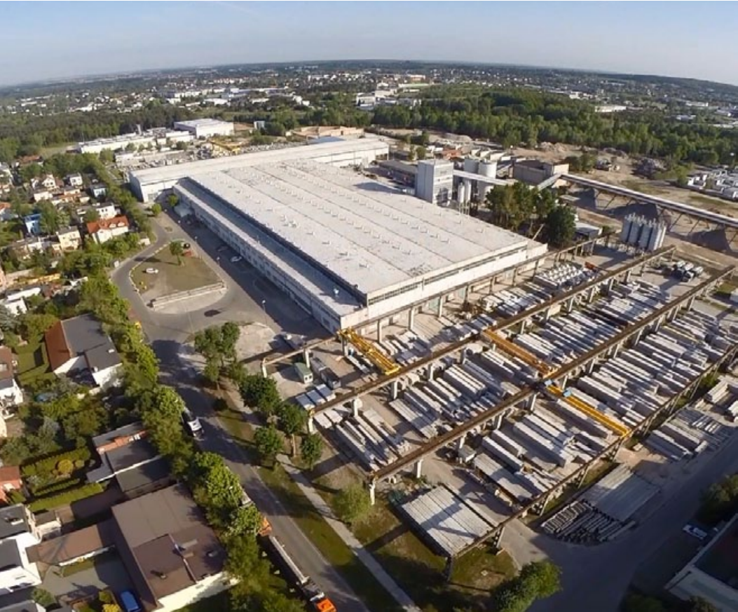
Fig 1. A view of Pekabex S.A. (Poland).

The company produces traditional reinforced elements, as well as modern prestressed elements used in enclosed structures (e.g. production and storage halls, offices, trade objects, railway stations, parking places), engineering objects (e.g. bridges, tunnels), and atypical designs. We offer wide range of standard products and realize special orders for individual designs. Pekabex S.A. possesses five production plants located in Poznań, Gdańsk, Bielsko-Biała, Mszczonów and Marktzeuln.