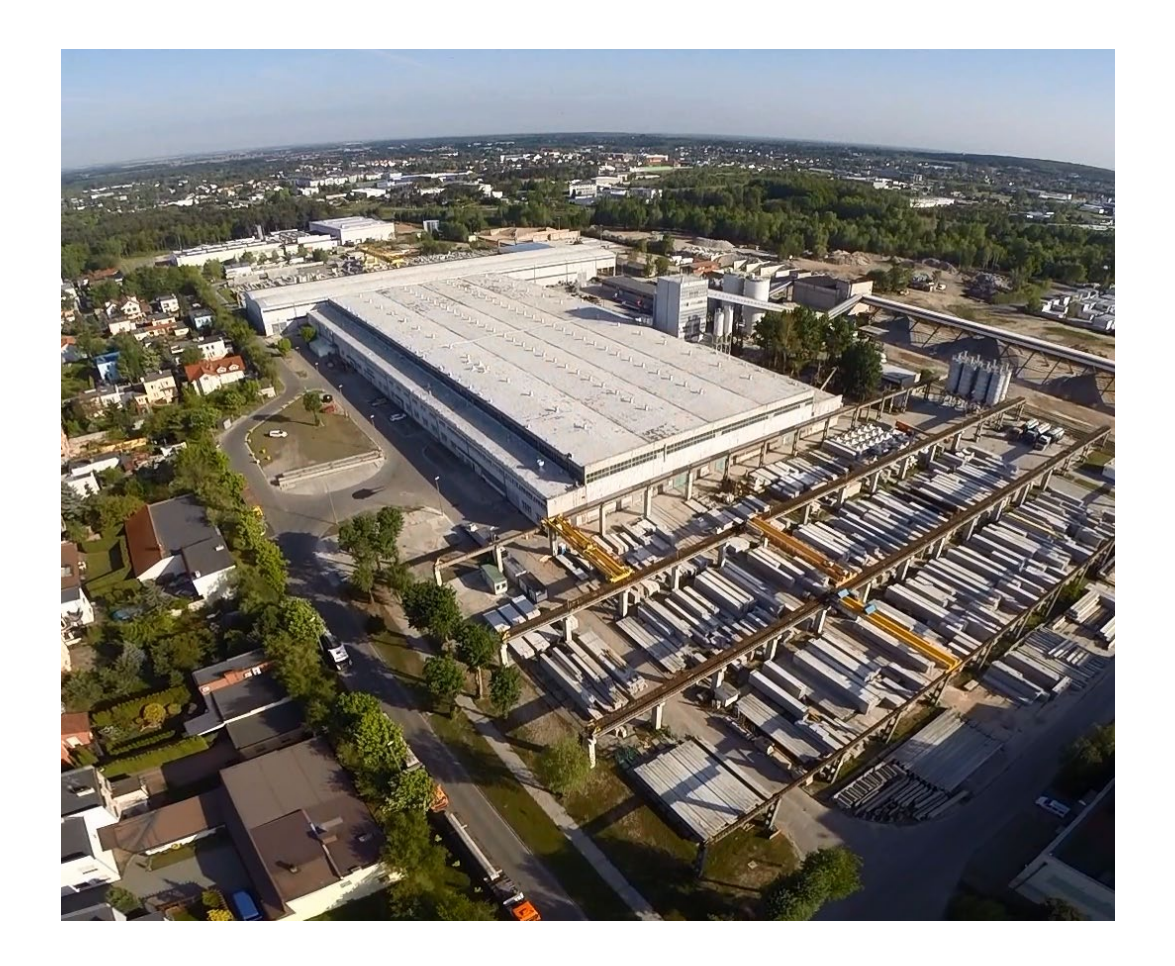
Fig 1. A view of Pekabex S.A. (Poland).

The company produces traditional reinforced elements, as well as modern prestressed elements used in enclosed structures (e.g. production and storage halls, offices, trade objects, railway stations, parking places), engineering objects (e.g. bridges, tunnels), and atypical designs. We offer wide range of standard products and realize special orders for individual designs. Pekabex S.A. possesses five production plants located in Poznań, Gdańsk, Bielsko-Biała, Mszczonów and Marktzeuln.