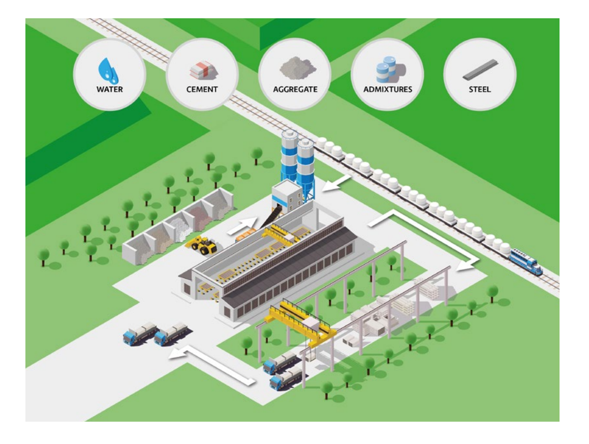
A scheme of manufacturing of the prefabricated filigree slabs by Pekabex BET S.A.