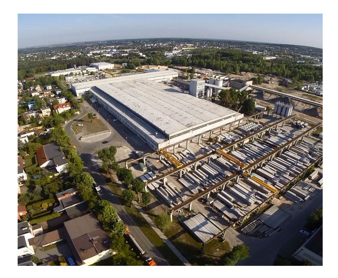
Fig 1. A view of Pekabex S.A. (Poland).

The company produces traditional reinforced elements, as well as modern prestressed elements used in enclosed structures (e.g. production and storage halls, offices, trade objects, railway stations, parking places), engineering objects (e.g. bridges, tunnels), and atypical designs. We offer wide range of standard products and realize special orders for individual designs. Pekabex S.A. possesses six production plants located in Poznań, Gdańsk, Bielsko-Biała, Mszczonów and Marktzeuln.