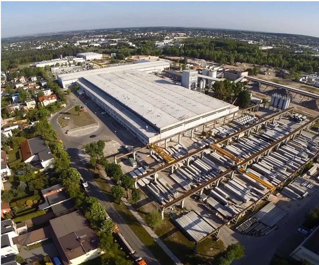
Fig 1. A view of Pekabex S.A. (Poland).

The company produces traditional reinforced elements, as well as modern prestressed elements used in enclosed structures (e.g. production and storage halls, offices, trade objects, railway stations, parking places), engineering objects (e.g. bridges, tunnels), and atypical designs. We offer wide range of standard products and realize special orders for individual designs. Pekabex S.A. possesses six production plants located in Poznań, Gdańsk, Bielsko-Biała, Mszczonów and Marktzeuln.